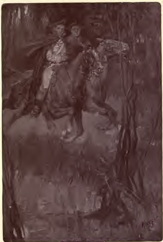
"The two were soon in the midst of a vast swamp."